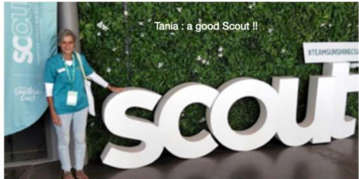
Tania : a good Scout !!