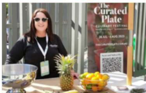
The Curated Plate CULINARY FESTIVAL 28 JUL - 4 AUG 2023 THECURATEDPLATE.COM.AU