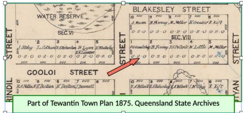
Part of Tewantin Town Plan 1875.