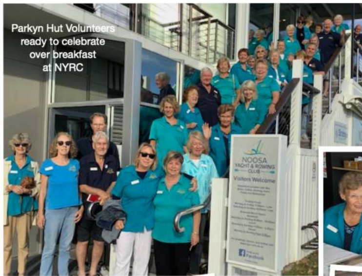
Parkyn Hut Volunteers ready to celebrate over breakfast at NYRC