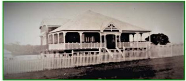
"Auchenraher" on the corner of Gooloi and Sidoni Streets ca 1920.